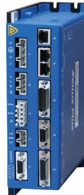
Xenus PLUS XEL