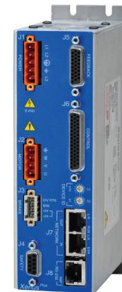
Xenus PLUS XEC