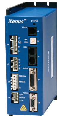
Xenus XTL AFS