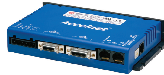
Accelnet ADP AFS