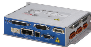
Accelnet PLUS BE2 Stepnet PLUS TE2