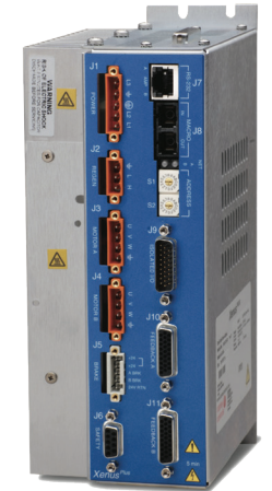
Xenus PLUS XM2