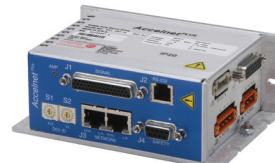
Accelnet PLUS BEL Stepnet PLUS TEL