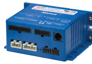
Xenus XSJ AFS