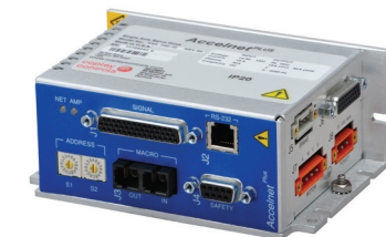
Accelnet PLUS BML