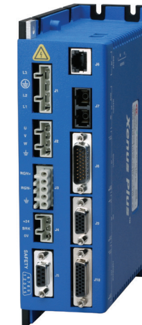
Xenus PLUS XML

In addition to customized drives, Copley's motion subsystem design and manufacturing capability can significantly reduce time to market while freeing-up key OEM resources to focus on core design issues. Copley's expertise in power and thermal management as well as experience in the accelerated life test of complex subsystems guarantee lowered cost of ownership. Optimized motion subsystem design ensures the highest level of performance in the smallest footprint.